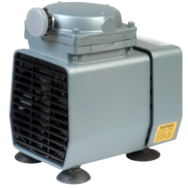
Vacuum Pump Part No: MC13307 Price: POA