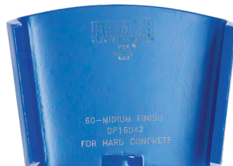
Winged 'knock on' fitting,