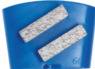
MEDIUM/ 60 GRIT