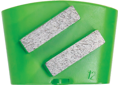
FINE/ 100 GRIT